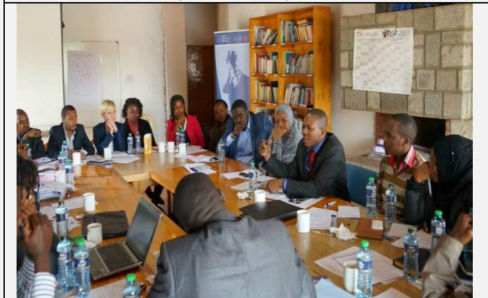
Breakfast meeting with young parliamentarians